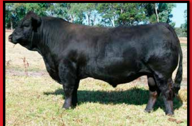
Bandeeka Blacks Nilo