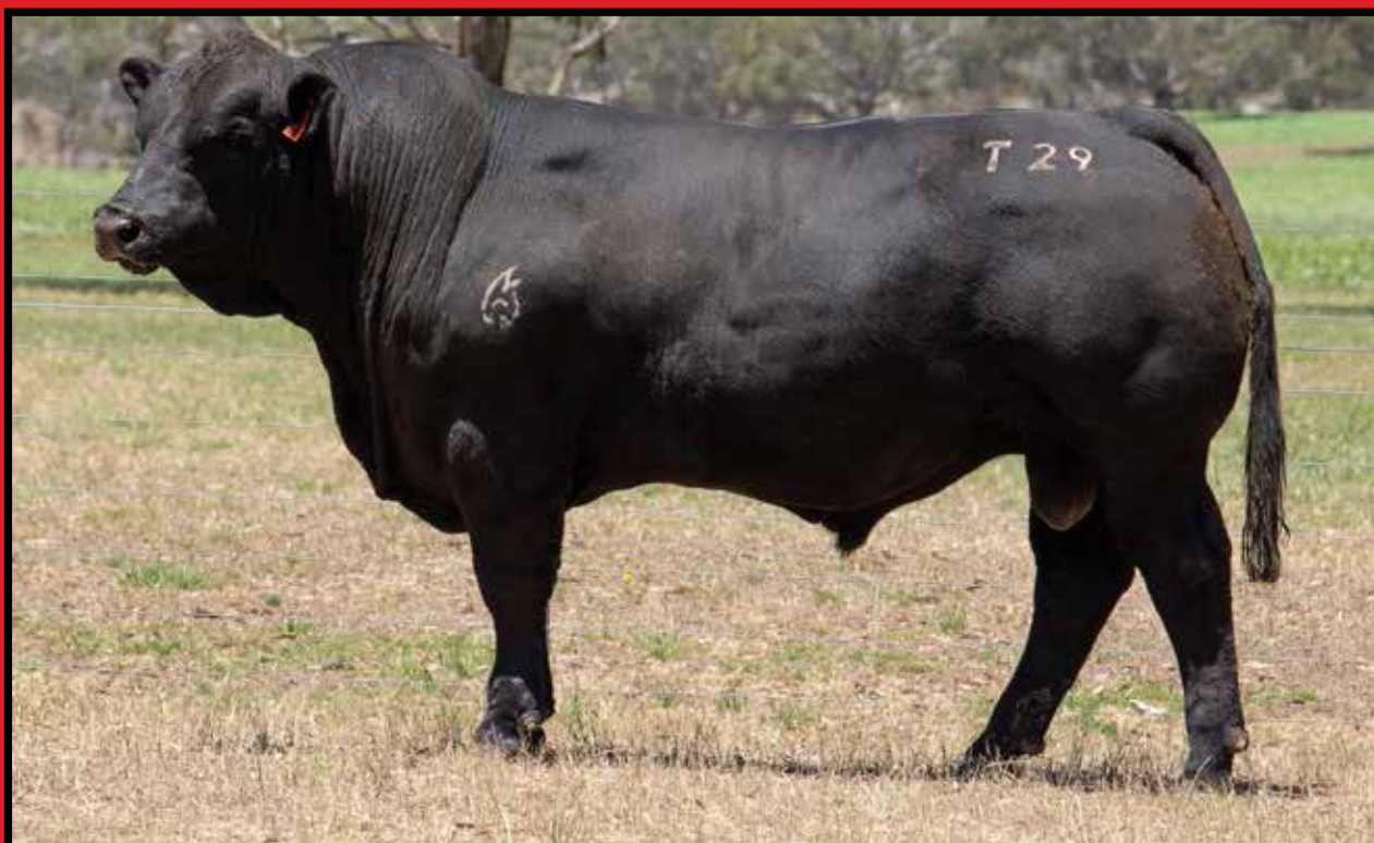
ZEUPT029: HOMO POLLED – HETERO BLACK – BORN 13/3/22