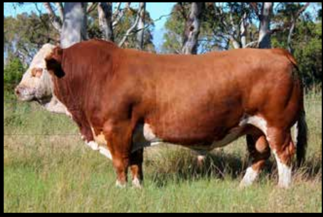
Grangeburn Masters Pride